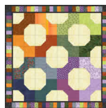
Bow Tie is one of the seventeen blocks considered to be part of the communication system used by the Underground Railroad.

Although unproven, many believe that quilts were hung on clotheslines and draped over porch railings to send messages to fleeing slaves.